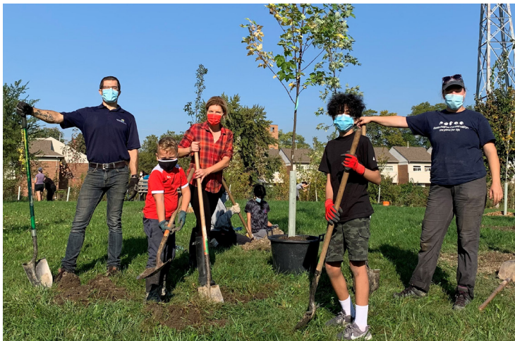
Volunteers helped plant 25 native trees at College Avenue Bikeway Park in Sandwich.

A similar greening initiative occurred in Southwest Detroit in April 2021 with 250 trees given to homeowners in the area.