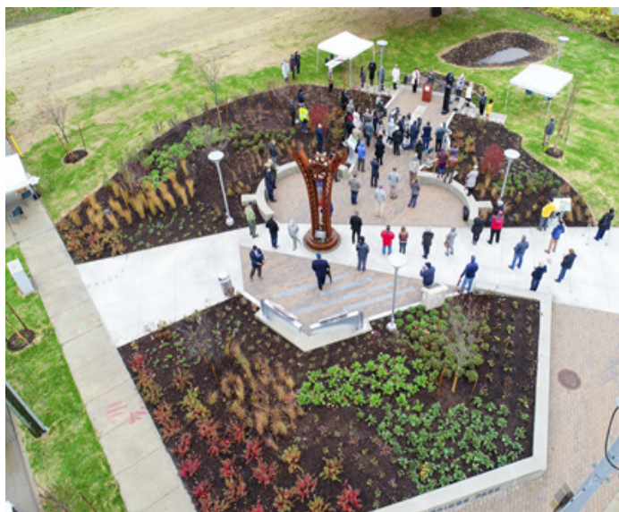
Fort Street Bridge Park Ribbon Cutting Ceremony (October 22, 2020)