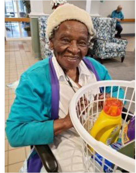
BCI, along with the Detroit Regional Chamber, provided 80 holiday baskets to local seniors.

completed several landscaping improvements around Mackenzie Hall in Sandwich. A heritage Jesuit Pear tree was relocated, and several perennials were added.