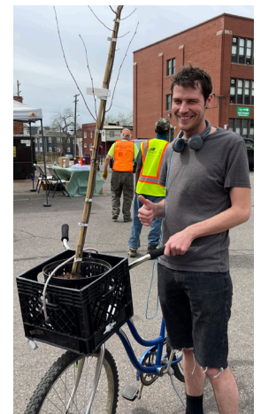
Residents selected one of five native species for pick up.