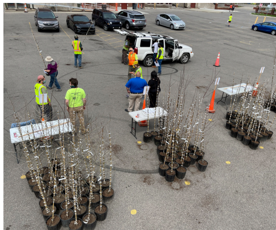
Volunteers bring trees to residents of Southwest Detroit waiting in their vehicles.

A second giveaway for Southwest Detroit residents is planned for 2024.