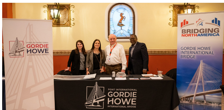
Michigan Hispanic Contractors Association 2020