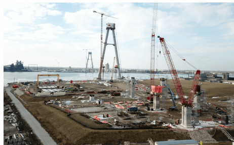
Canadian Bridge Site Pier Columns

Read more about all project updates on GordieHoweInternationalBridge.com