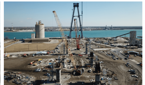
US Bridge Site Pier Columns