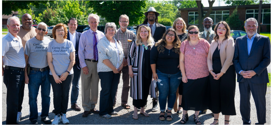
Representatives from the nine organizations who received funding through the 2022 COI initiative and members of the project team.

The Community Organization Investment (COI) initiative is a five-year program that provides funding to organizations serving Sandwich/west Windsor and Delray/Southwest Detroit. This year's application period recently closed, with 42 applications received in pursuit of the $100,000 (CDN) available on each side of the border. The funds support events, programming and infrastructure improvements that will benefit the communities. Over the past three years, the initiative has supported 23 agencies and organizations serving southwest Detroit and West Windsor. This year's applications will be reviewed by the Local Community Group, comprised of 16 stakeholders from Windsor and Detroit, who will recommend projects for funding. Applicants will be notified in April about the status of their application and funding will be released to recipients in July.