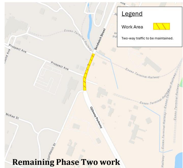
Remaining Phase Two work

Public notification will be issued in advance of work beginning.