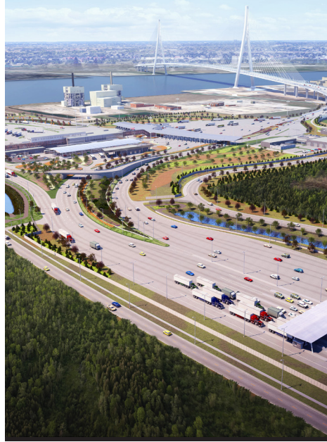
Canadian Port of Entry