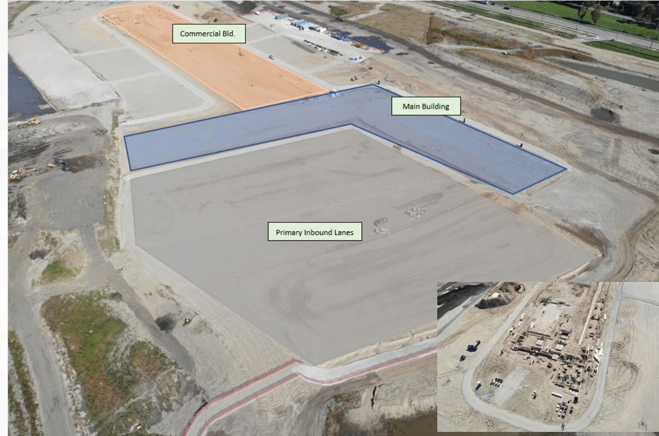
US Port of Entry Main Building.