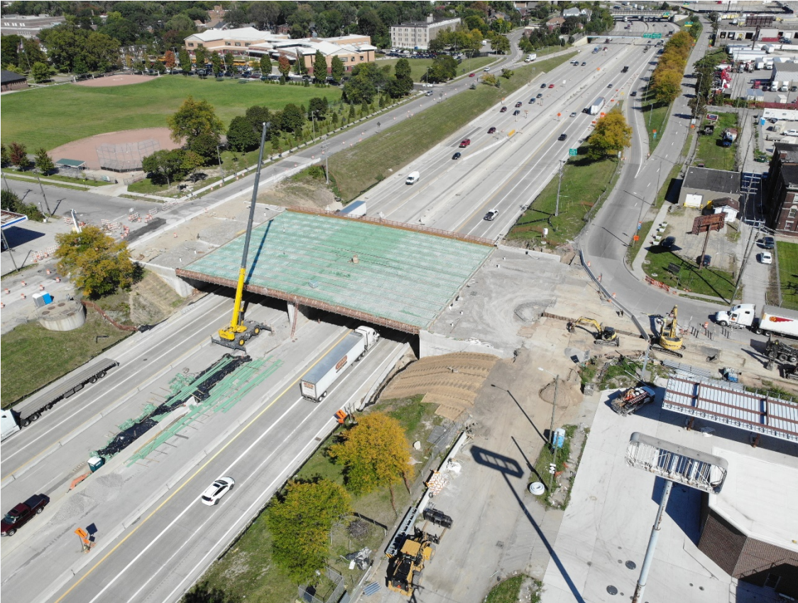
I-75 Corridor Clark St Bridge