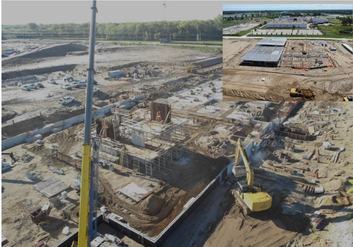
Canadian Port of Entry Main Building.