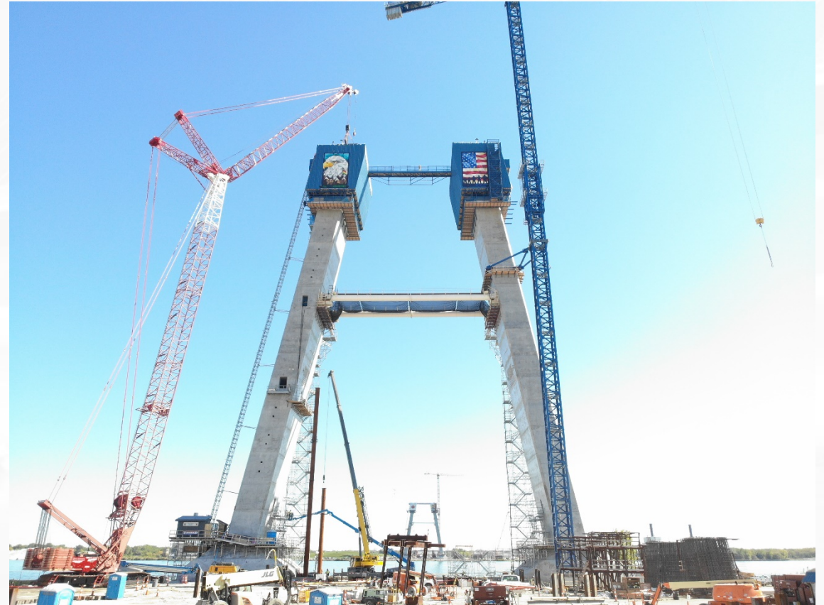
US bridge site tower work