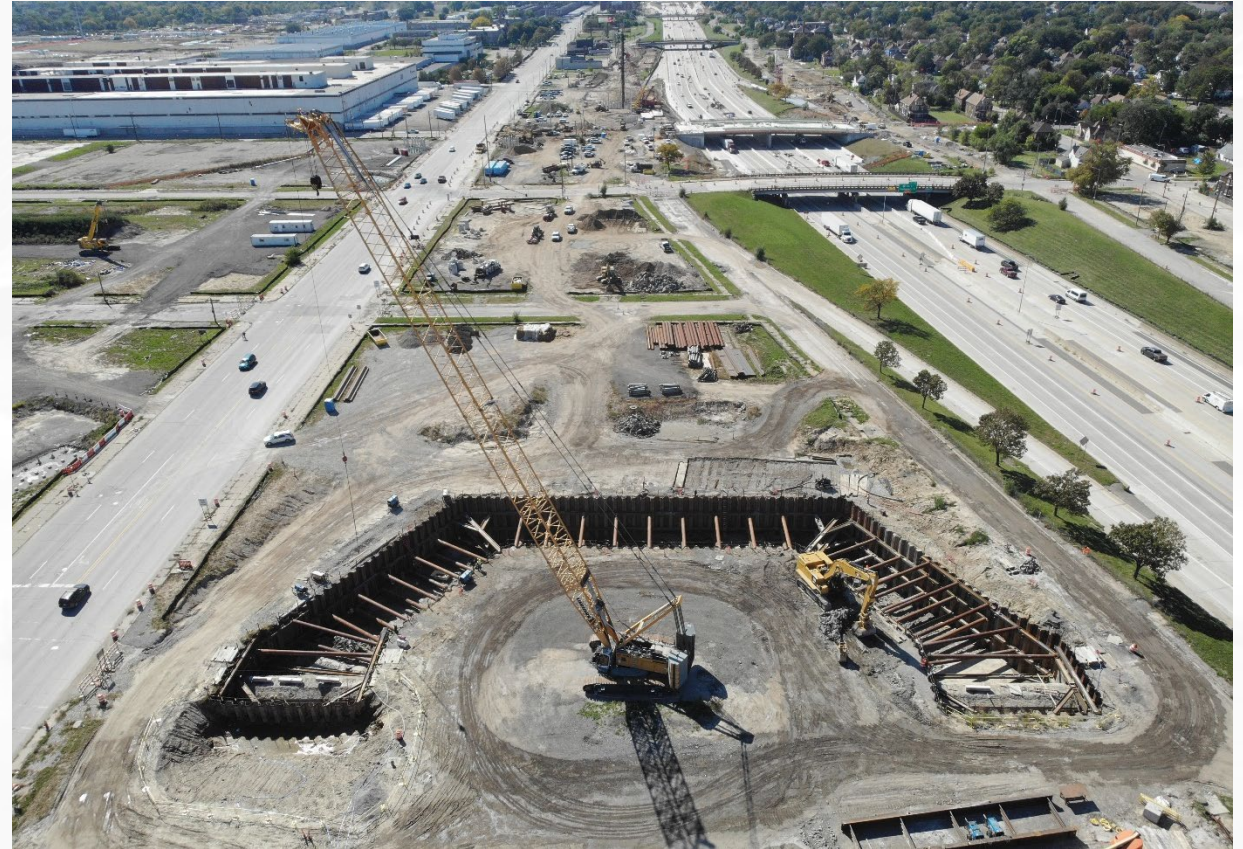
I-75 Siphons Cavalry Street.