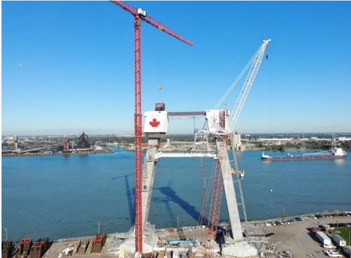
Canadian bridge site tower work